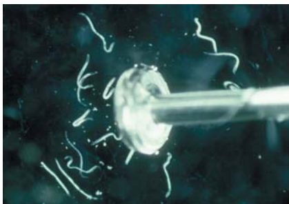
Figure 1 Comparison between FLN and a pin head demonstrating their microscopic size.

FLN are microscopic (Figure 1) soil borne organisms that can be pathogenic to a range of important economic crops e.g. potato. Identifying pathogenic FLN from beneficial FLN is problematic due to minute differences in their taxonomy and an ever decreasing skill-base of taxonomists.